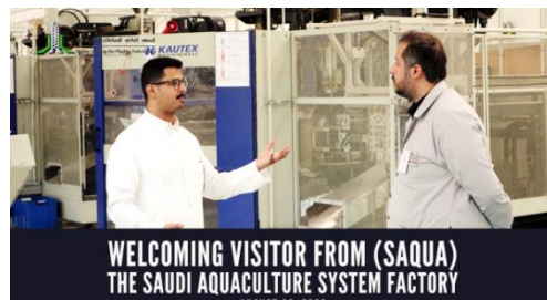
WELCOMING VISITOR FROM (SAQA) THE SAUDI AQUACULTURE SYSTEM FACTORY AUGUST 02, 2023