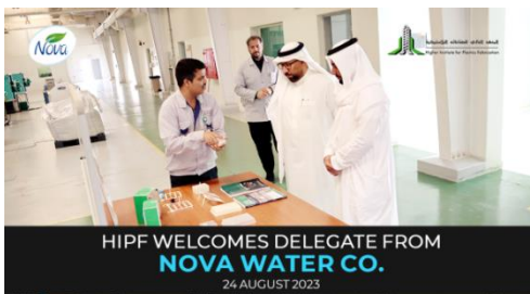
HIPF WELCOMES DELEGATE FROM NOVA WATER CO. 24 AUGUST 2023