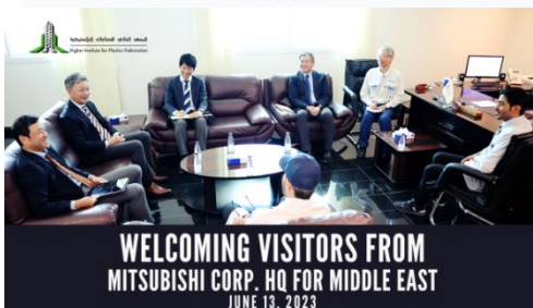
WELCOMING VISITORS FROM MITSUBISHI CORP. HQ FOR MIDDLE EAST JUNE 13, 2023