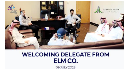
WELCOMING DELEGATE FROM ELM CO. 09 JULY 2023