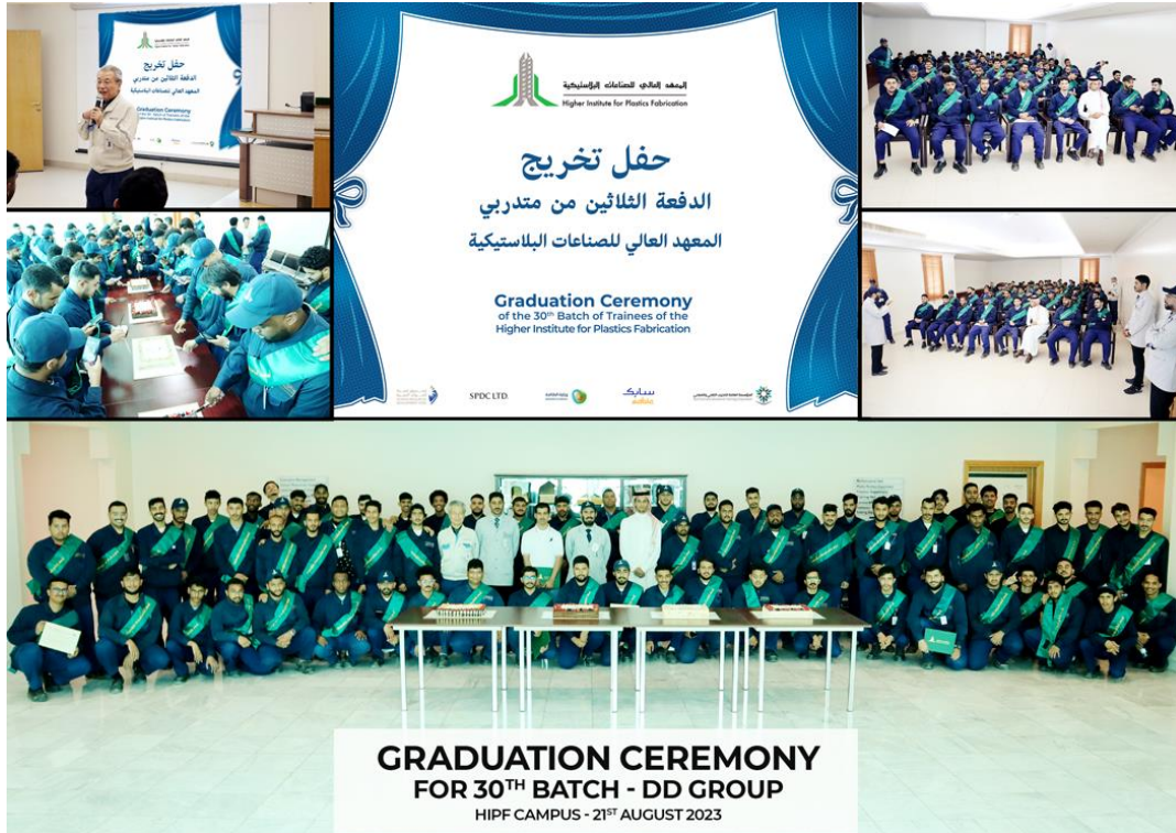
GRADUATION CEREMONY FOR 30 TH BATCH - DD GROUP HIPF CAMPUS - 21 ST AUGUST 2023

21 August 2023: DD-group Graduation Ceremony conducted, which is the 30th Batch of Trainees of the Higher Institute for Plastics Fabrication.