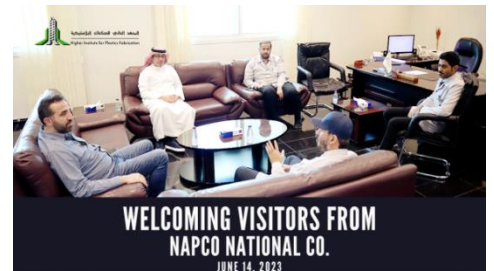
WELCOMING VISITORS FROM NAPCO NATIONAL CO. JUNE 14, 2023