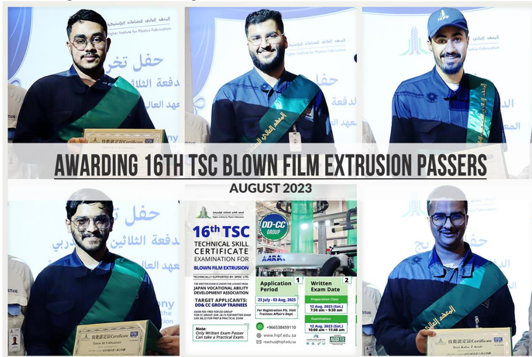
AWARDING 16TH TSC BLOWN FILM EXTRUSION PASSERS

21 August 2023: Awarding to Passers of the 16th TSC Blown Film Extrusion